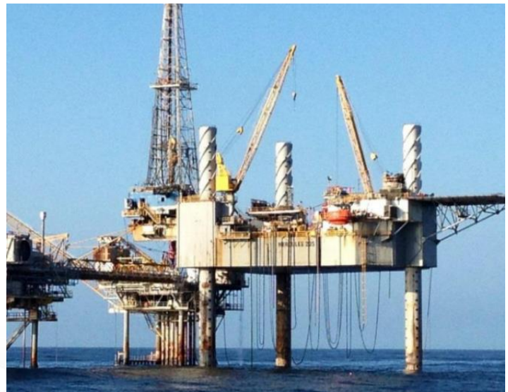
Hercules 2015 Drilling Rig

In order to earn a 50% working interest (equal to a 40.625% revenue interest) in the SMI-6 Lease, Otto will contribute 66.67% of the costs of the well (estimated at US$5.3 million net to Otto). Any costs above this amount in respect of the SM-6 #2 well and all future expenditure on the license will be in accordance with Otto and Byron’s participating interest (Otto 50%).