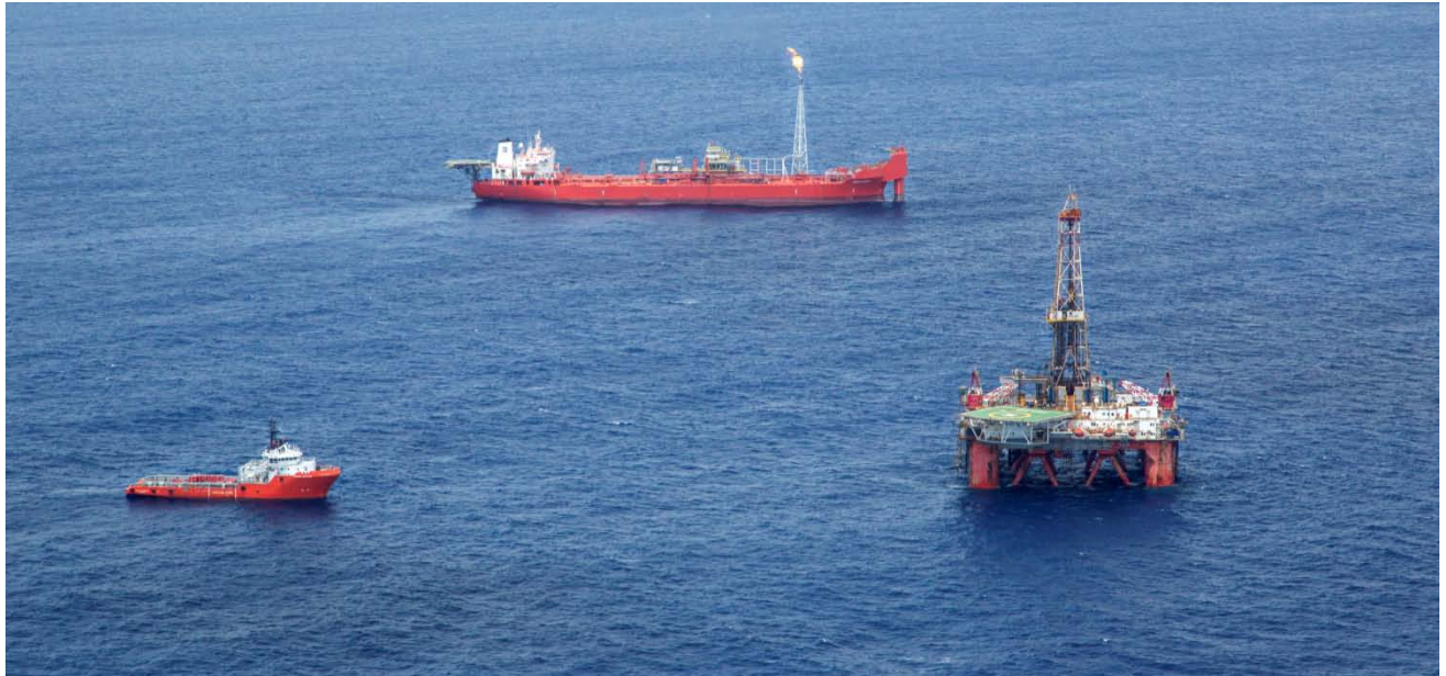
Figure: FPSO Rubicon Intrepid and MODU Ocean Patriot in operations in the Galoc oil field, June 2013